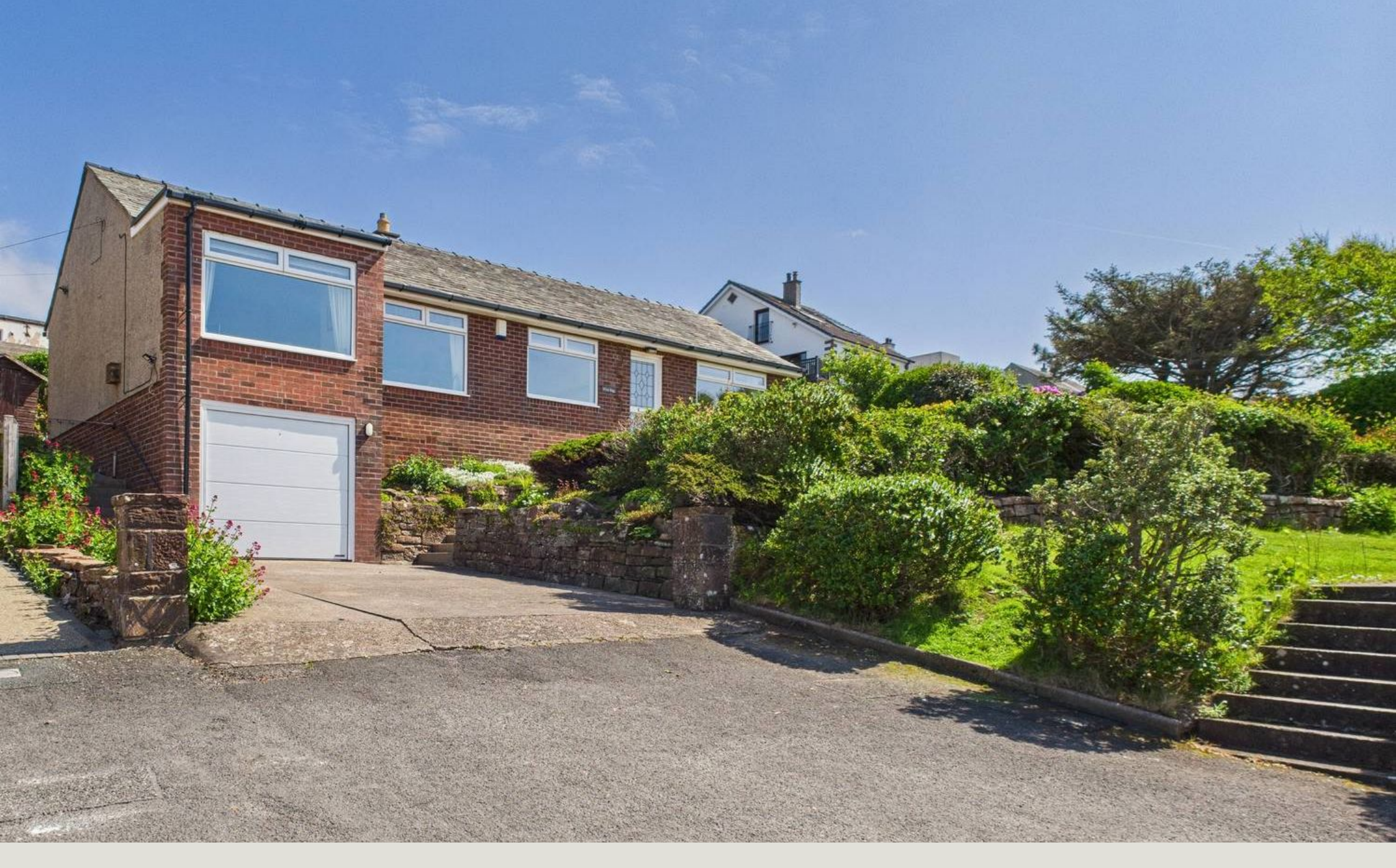
Whinrigg, Nethertown Road, St. Bees, CA27 0AY Guide Price £395,000