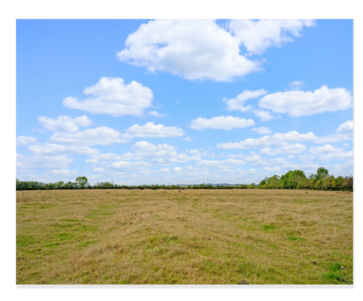
Illustration for identification purposes only, measurements are approximate, not to scale. (ID1123429)

Approximate Gross Internal Area = 183.2 sq m / 1972 sq ft (Including Garage)