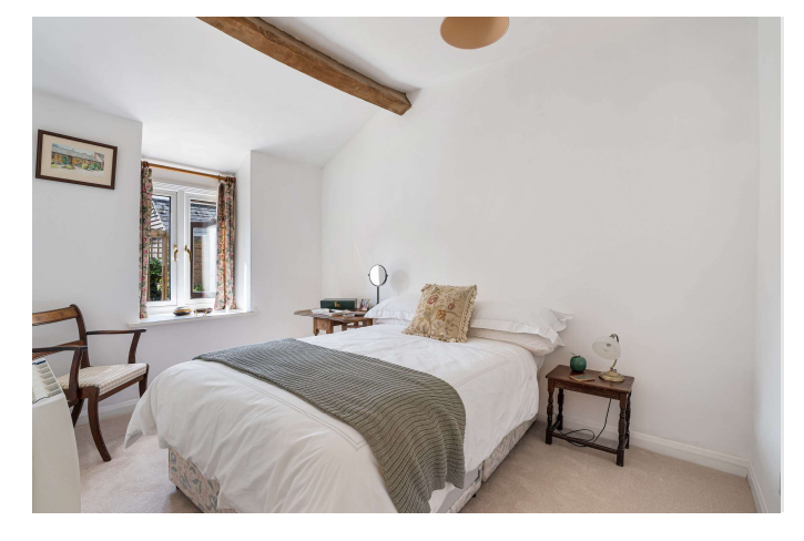
Fixtures and Fittings All items mentioned in these sale particulars are included in the sale. All other items are expressly excluded.

Council Tax This is payable to Stratford on Avon District Council. The property is listed in band C.