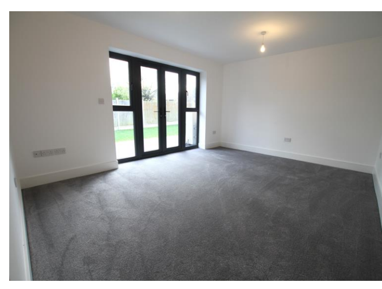
To view this property call Colebrook Sturrock on 01304\ 381155