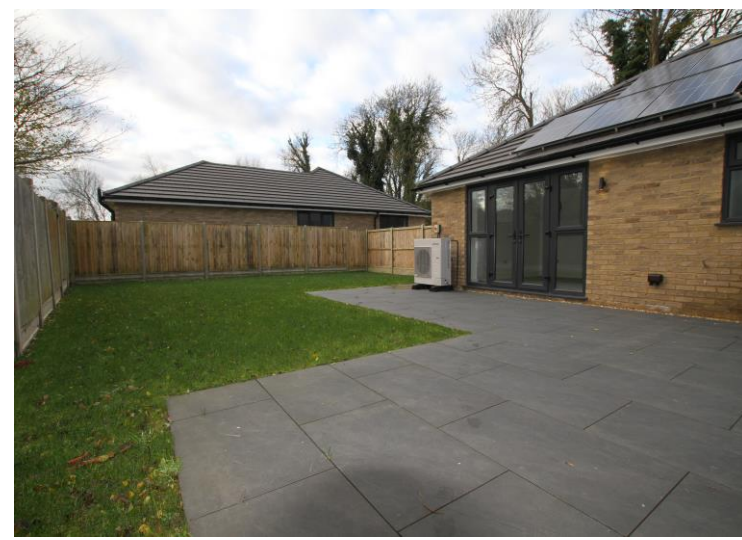
To view this property call Colebrook Sturrock on 01304\ 381155