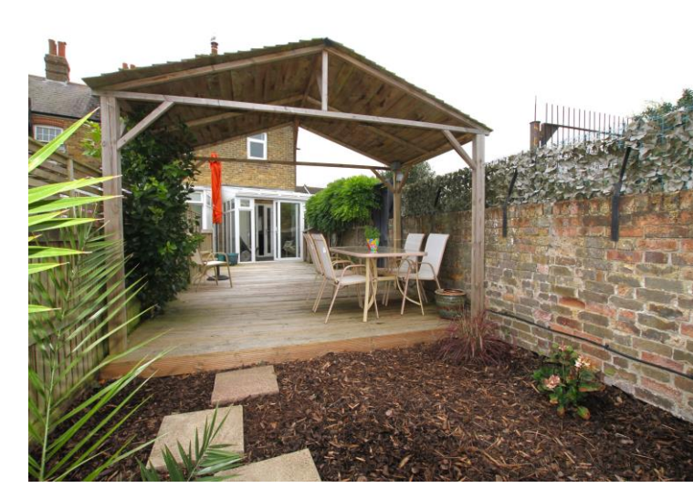
To view this property call Colebrook Sturrock on 01304\ 381155