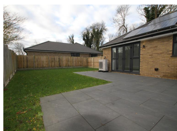
To view this property call Colebrook Sturrock on 01304\ 381155