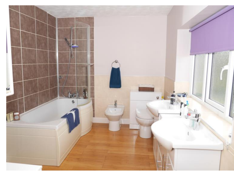
To view this property call Colebrook Sturrock on 01304\ 381155