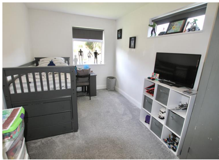
To view this property call Colebrook Sturrock on 01304\ 381155