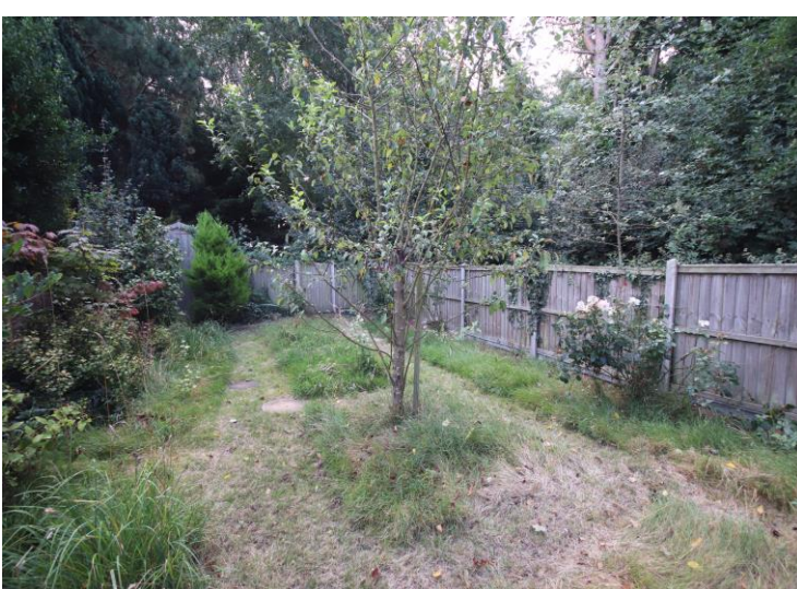
To view this property call Colebrook Sturrock on 01304\ 612197