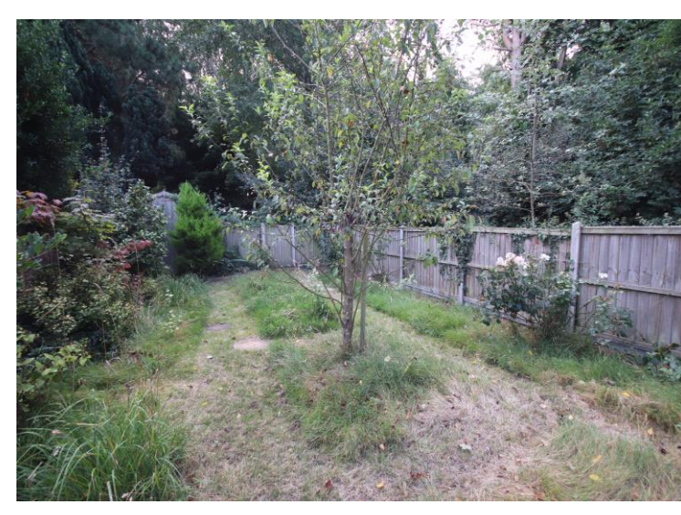
To view this property call Colebrook Sturrock on 01304\ 612197