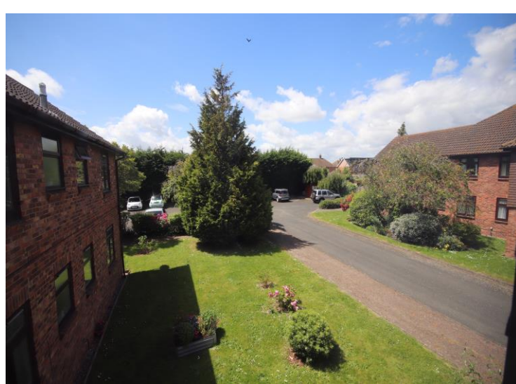
To view this property call Colebrook Sturrock on 01304\ 612197