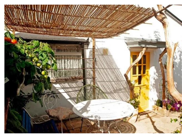
To view this property call Colebrook Sturrock on 01304\ 612197