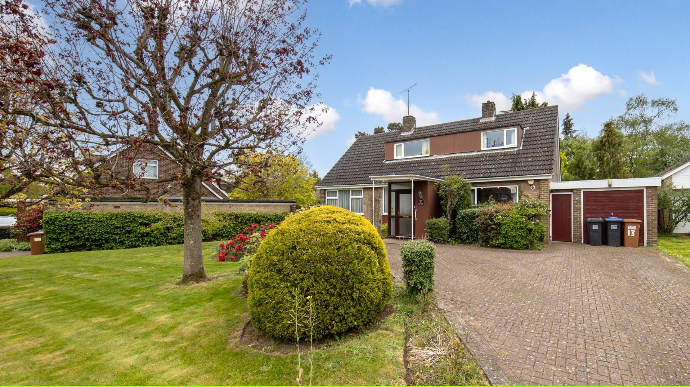
The Ryde Hatfield, Hertfordshire