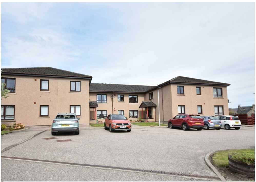
Offers Over £85,000

Located within close proximity to Elgin is this 1 Bedroom Ground Floor Flat which is located within the Hanover Housing Development designed for the over 55's.