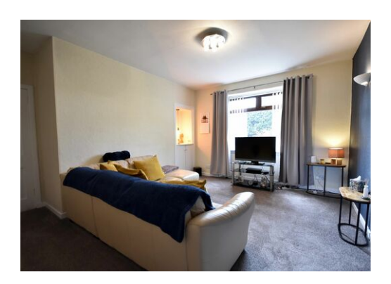
13 Braco Place Elgin Morayshire IV30 1PQ