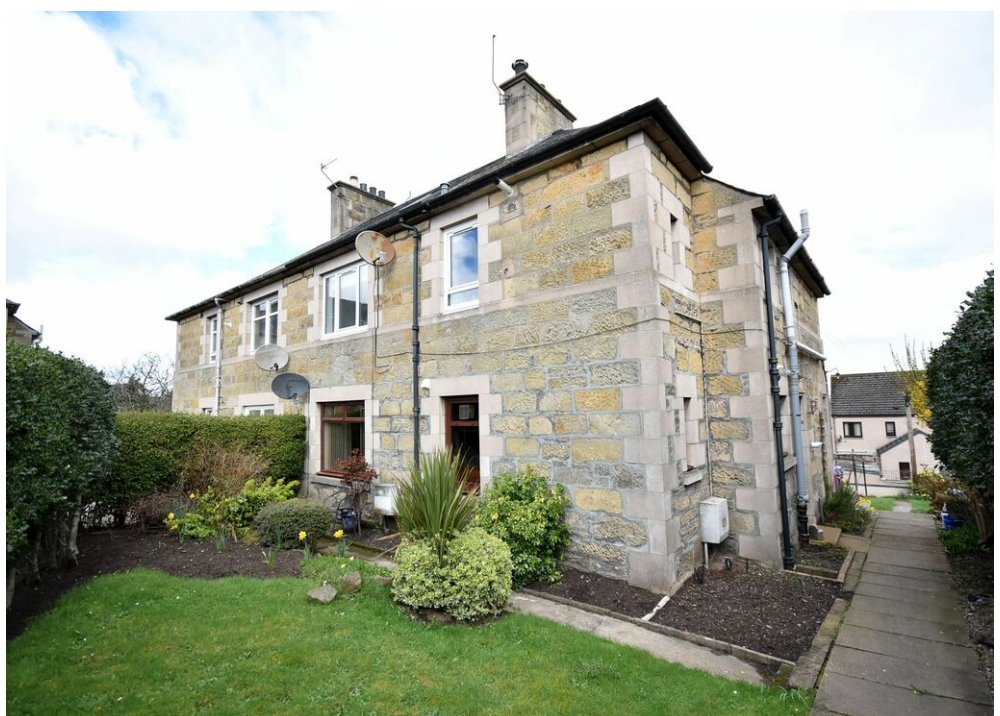
Offers Over £130,000

Located within the sought after West End area of Elgin is this 2 Bedroom Ground Floor Flat which benefits from its own Front and Rear Garden areas.