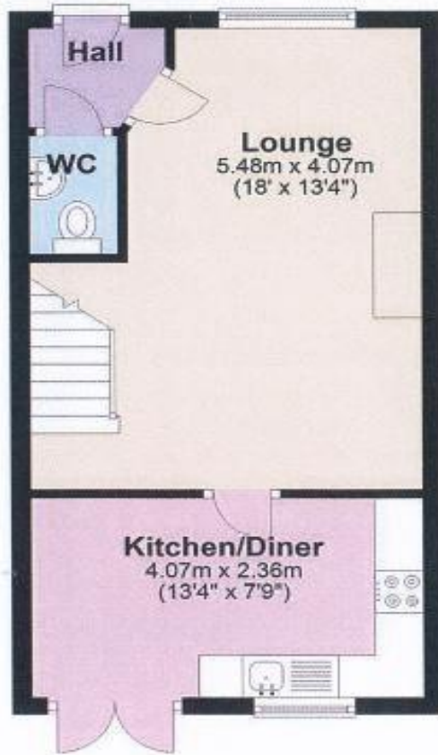
Master Floorplan Image Ground Floor Approx. 32.3 sq. metres (347.7 sq. feet)