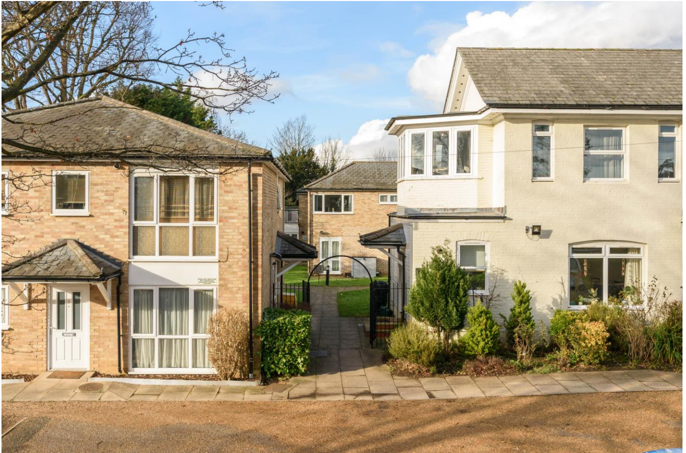
Flat 6, 23 Rydens Avenue, Walton-On-Thames, Surrey, KT12 3NS