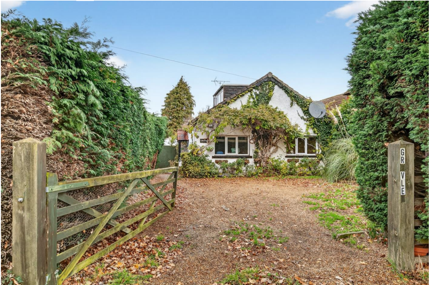
Grovely Field Common Lane Walton-On-Thames Surrey KT12 3QH