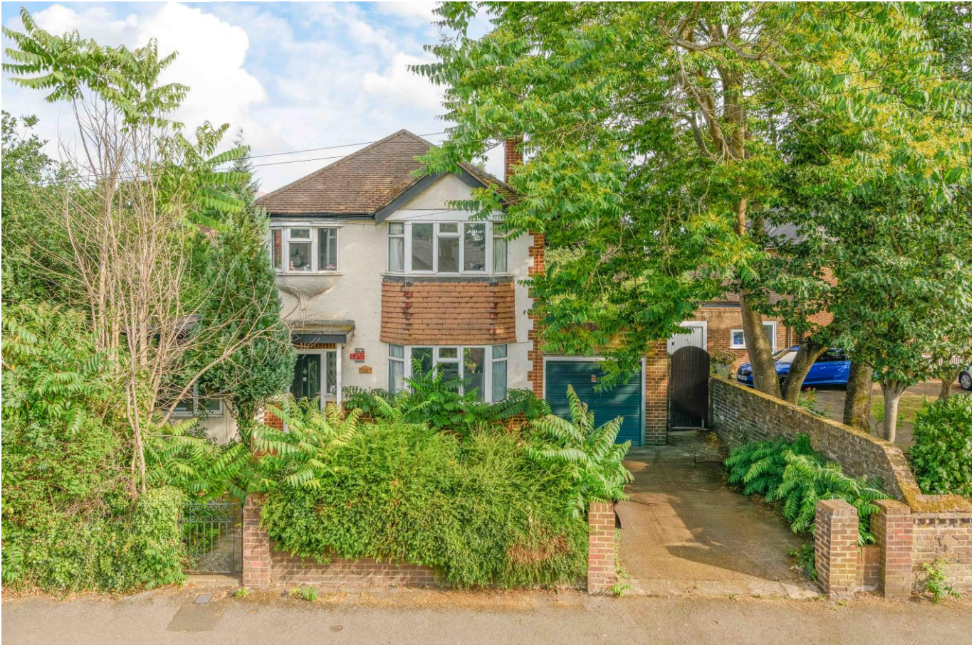
St Peters Lodge Burwood Road Hersham Surrey KT12 4AA