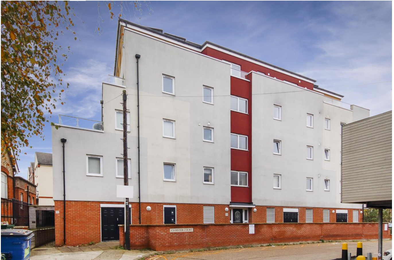
Flat 2 Cloister Court Church Street Walton-On-Thames Surrey KT12 2QS