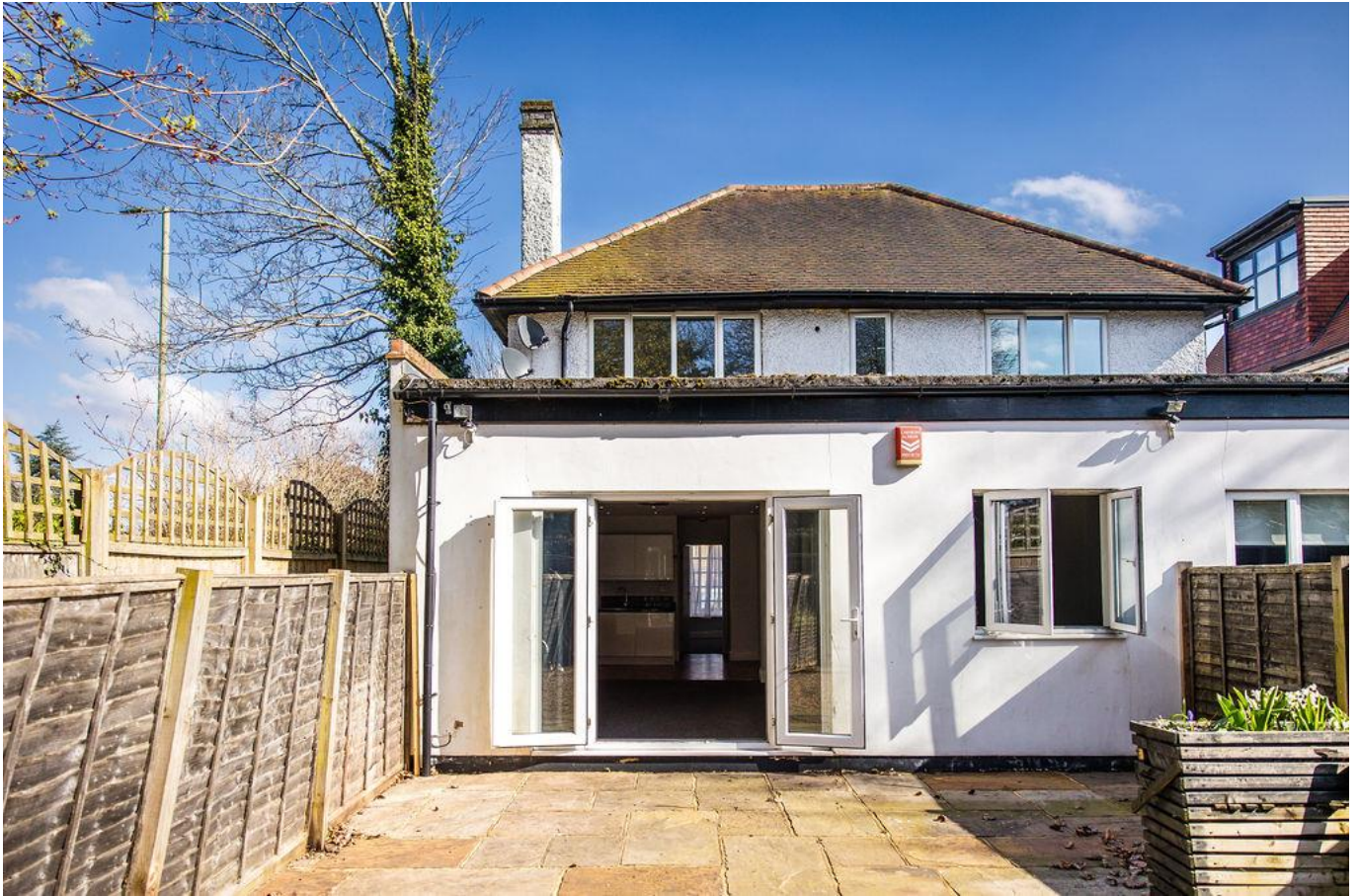
2 Tasman House New Zealand Avenue Walton-On-Thames Surrey KT12 1PU