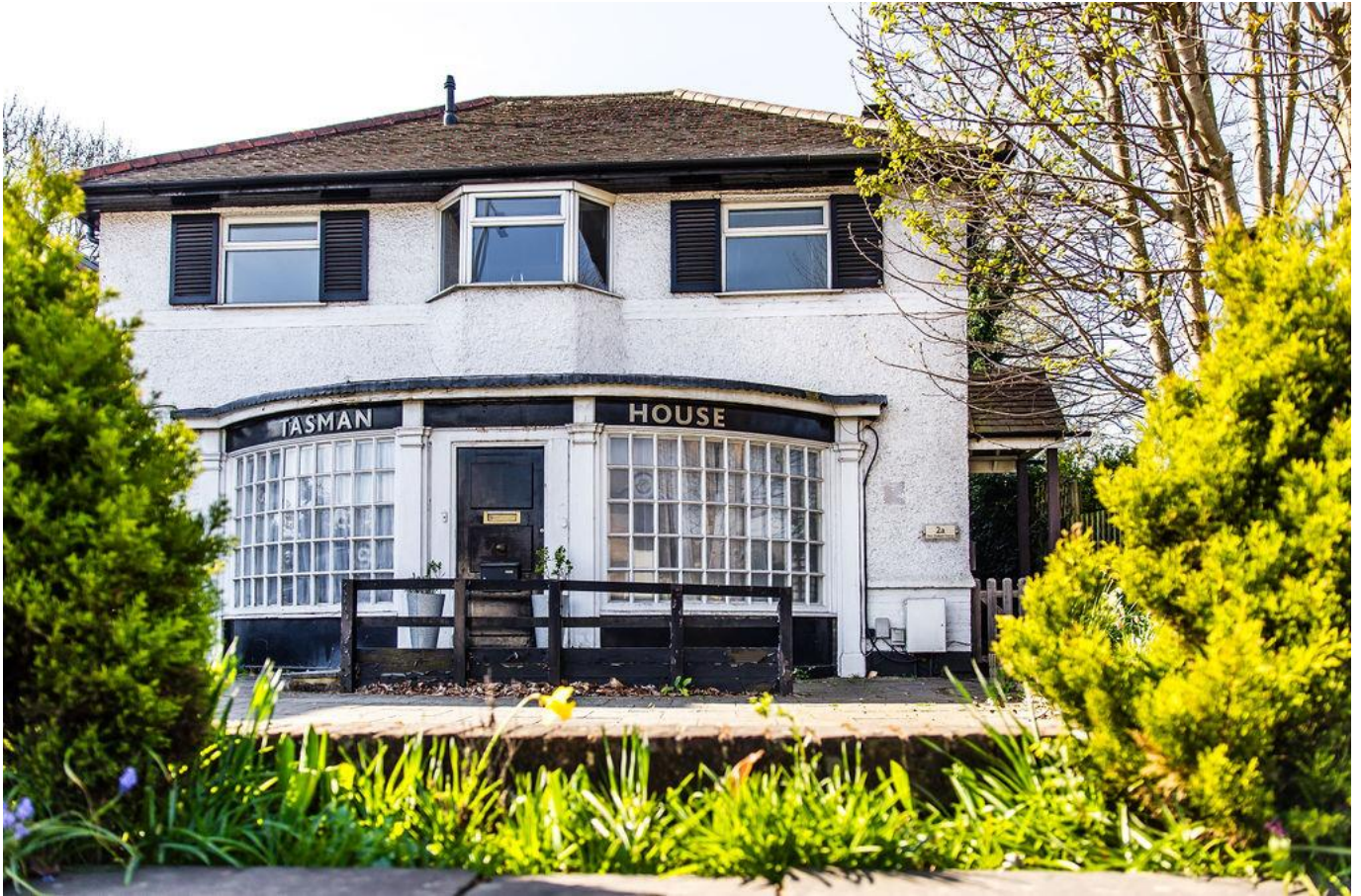
2 Tasman House New Zealand Avenue Walton-On-Thames Surrey KT12 1PU