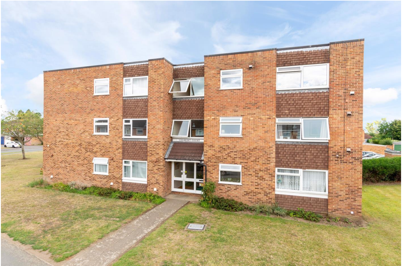
4 Egmont Court Egmont Road Walton-On-Thames Surrey KT12 2NN