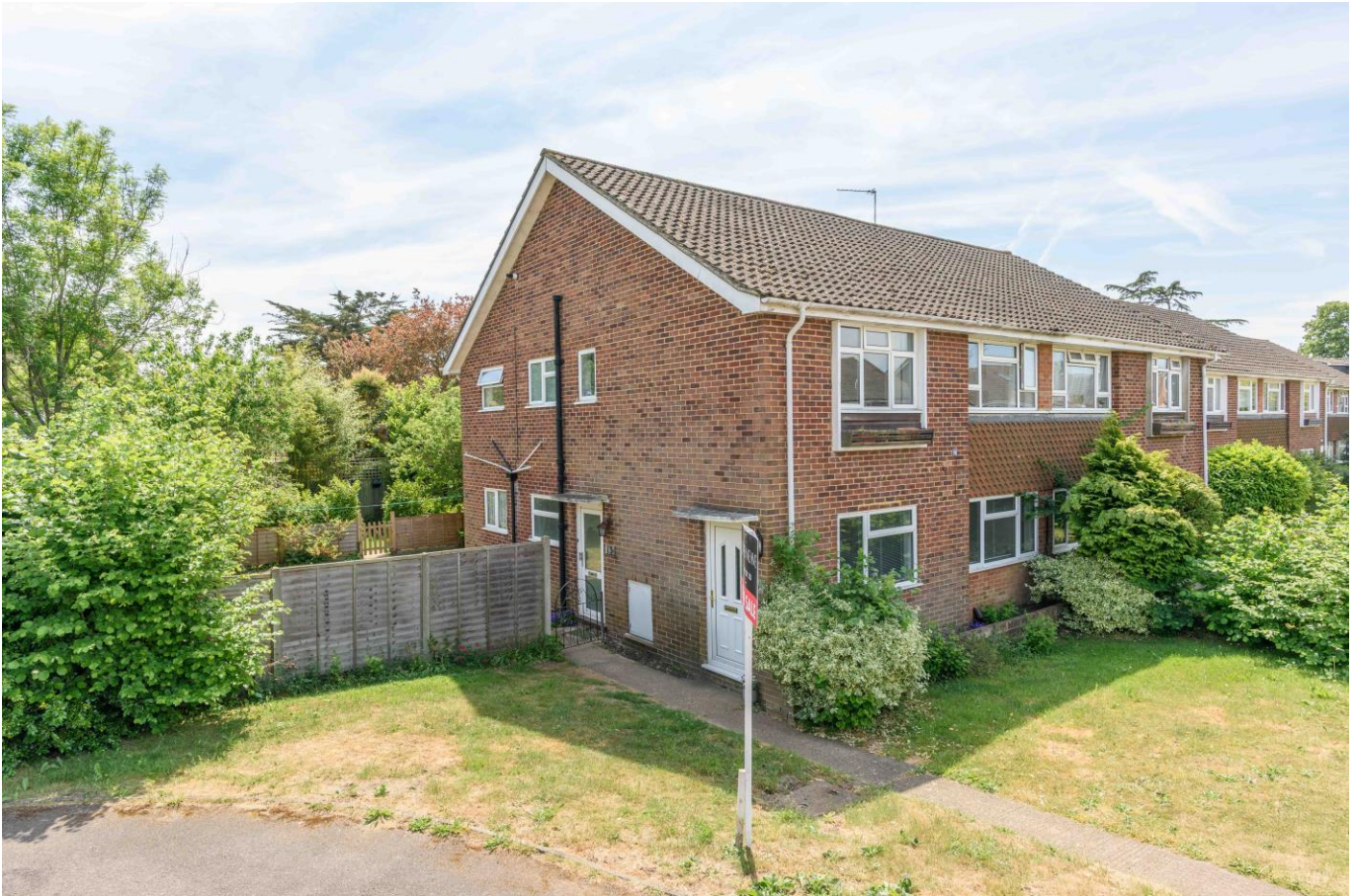
13 Brunswick Close Walton-On-Thames Surrey KT12 3JJ