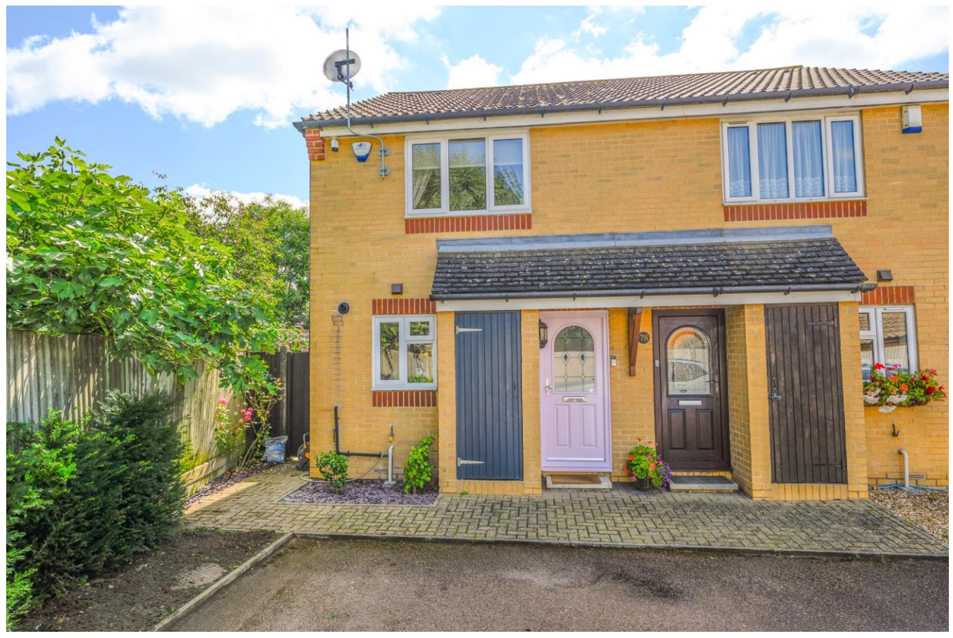
80 Annett Road Walton-On-Thames Surrey KT12 2JS £1950 pcm + Initial deposit