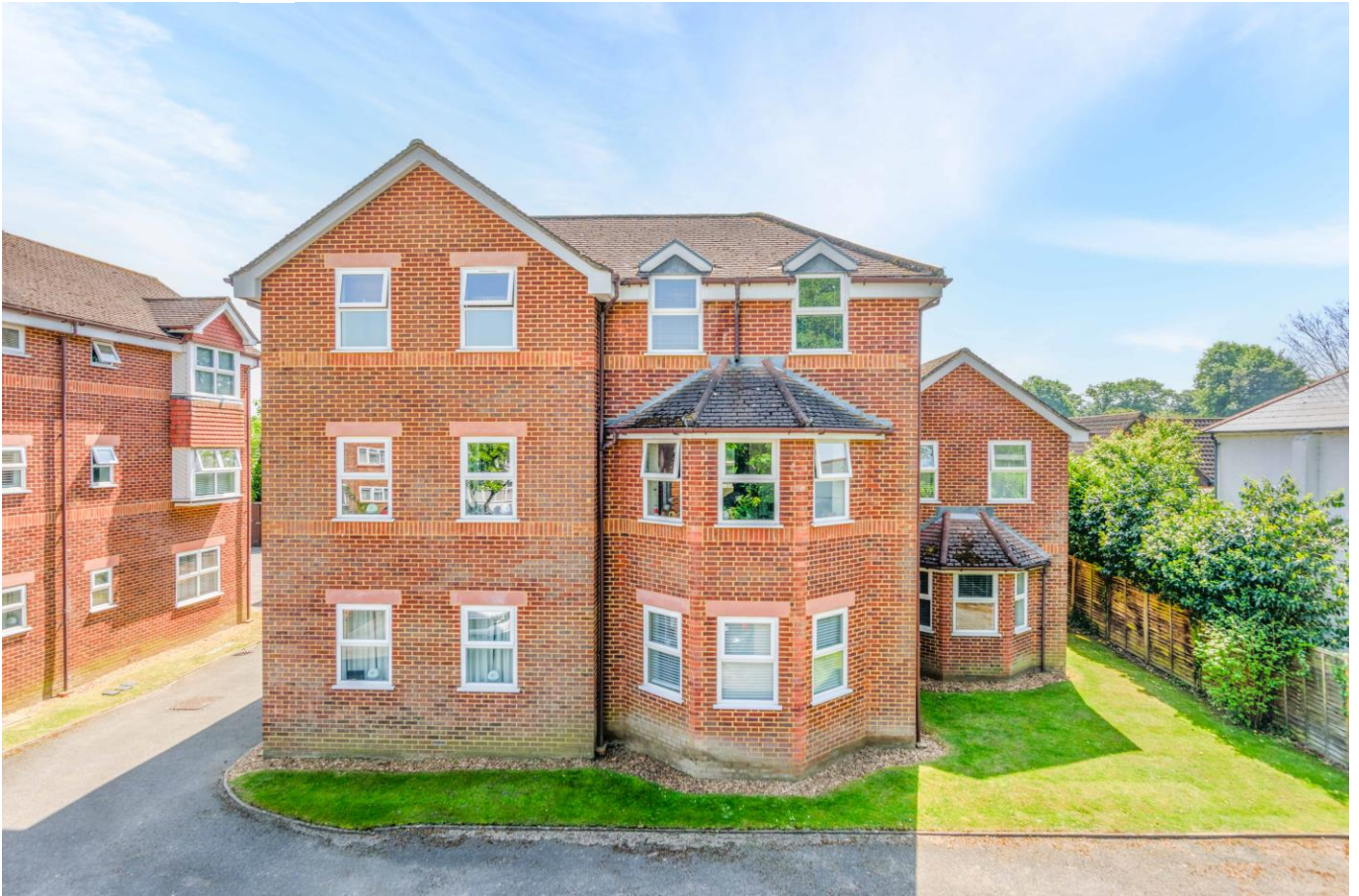
14 Findon Court Spinney Hill Row Town Surrey KT15 1BD