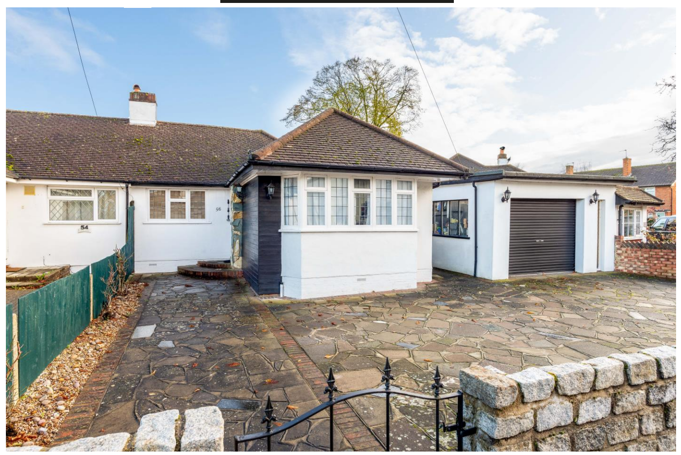
56 French Street Sunbury-On-Thames Surrey TW16 5JJ £2200pcm + Initial deposit