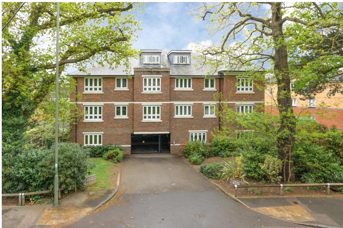
7 Consero Court Weybridge Surrey KT13 0RW