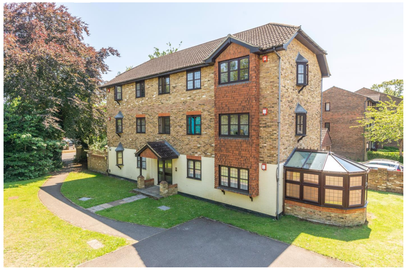
11 Rushmon Gardens Walton-On-Thames Surrey KT12 1QZ £270,000