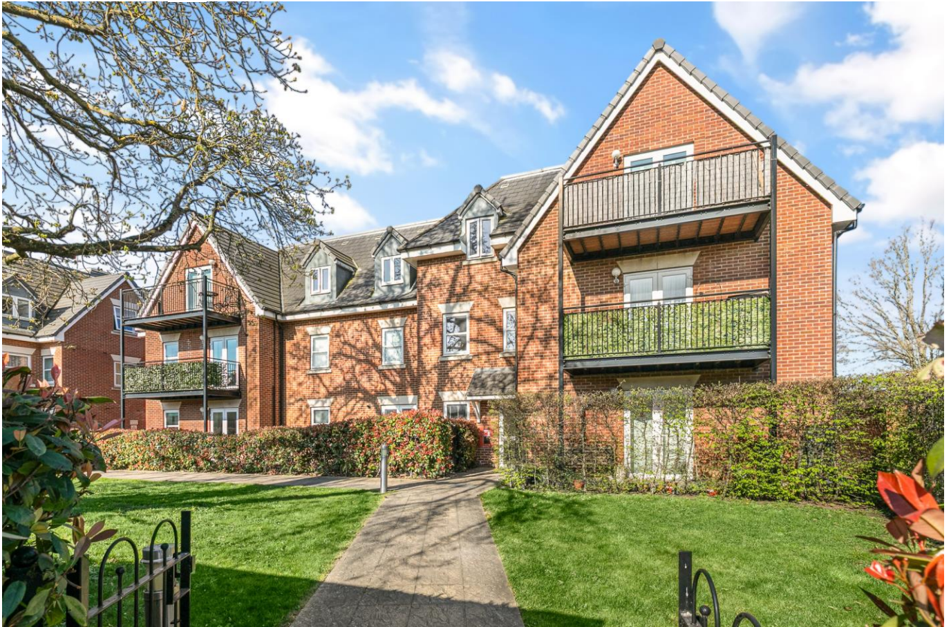
18 Beech House Molesey Road Hersham Surrey KT12 4SG