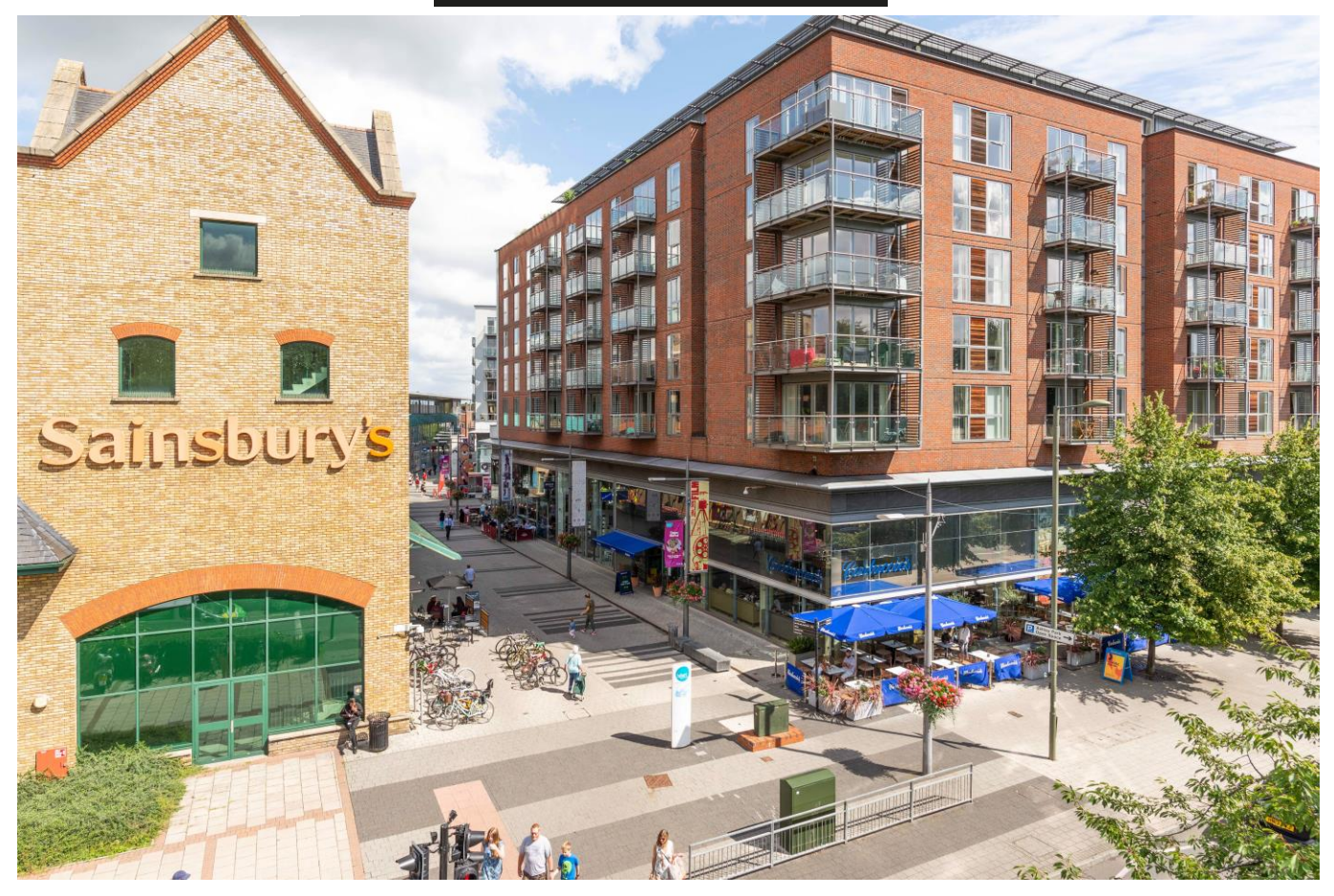
212 The Heart Walton-On-Thames Surrey KT12 1GB £1450 pcm + Initial deposit