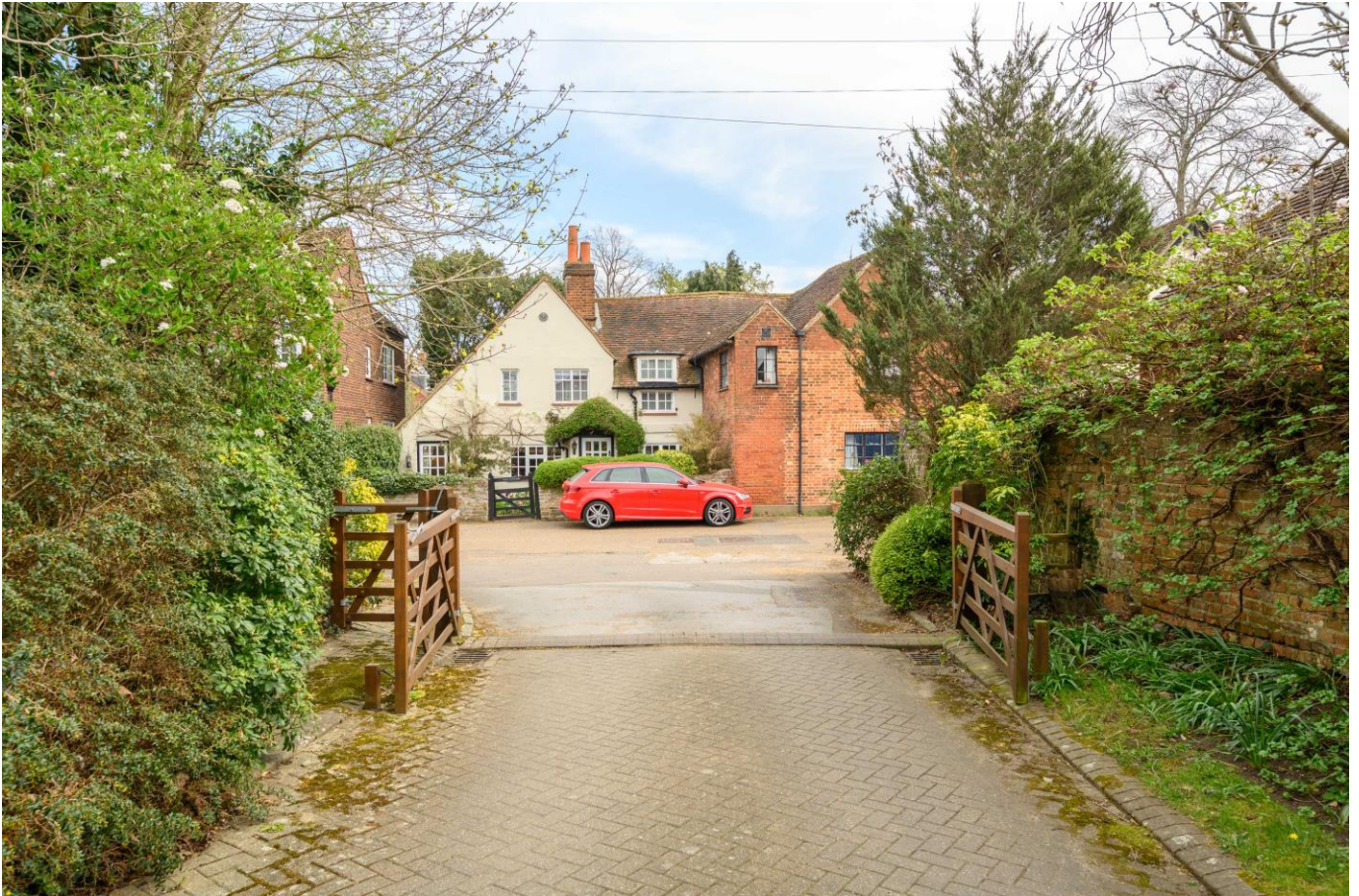
5 Trinity House The Cloisters Woking Surrey GU22 9JA