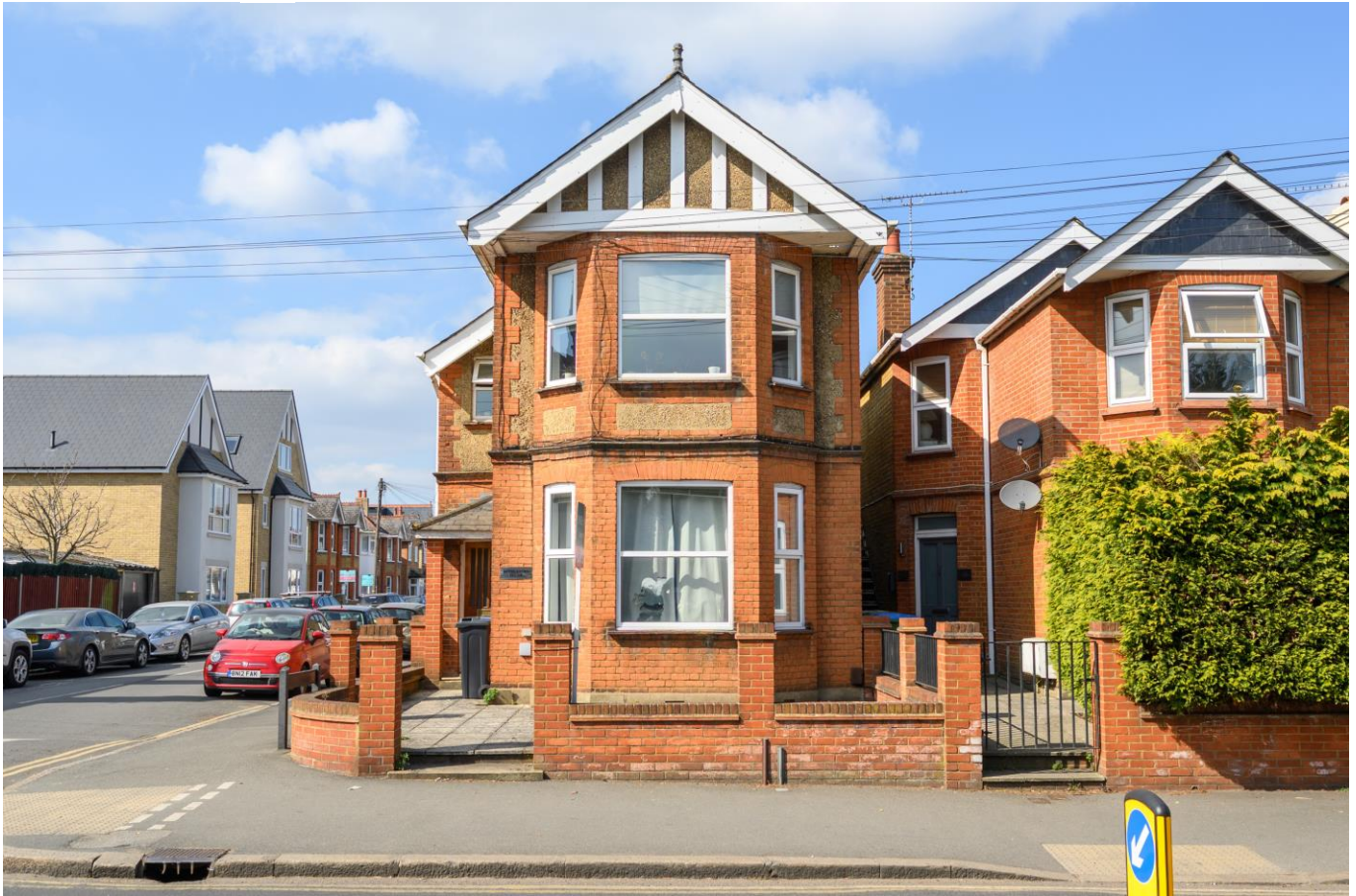
First Floor, 43 Terrace Road Walton-On-Thames Surrey KT12 2SP