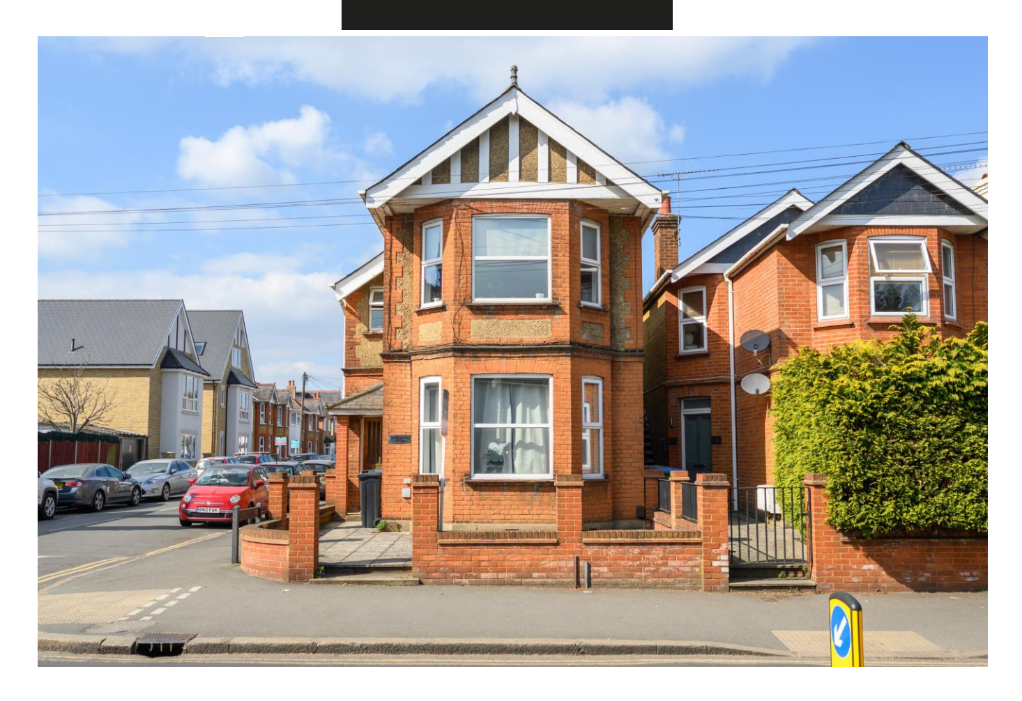
First Floor, 43 Terrace Road Walton-On-Thames Surrey KT12 2SP