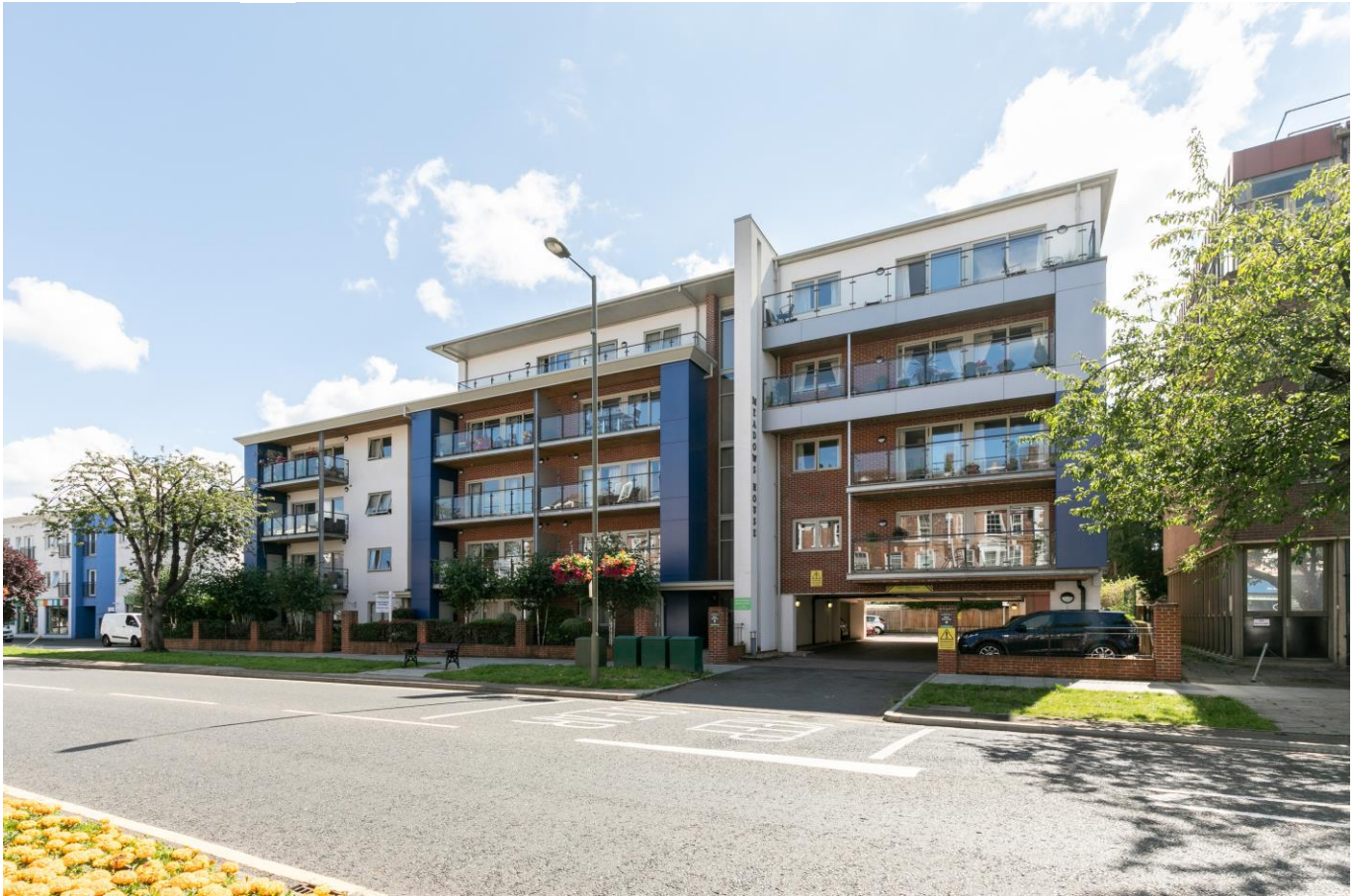
15 Meadows House New Zealand Avenue Walton-On-Thames Surrey KT12 1PG