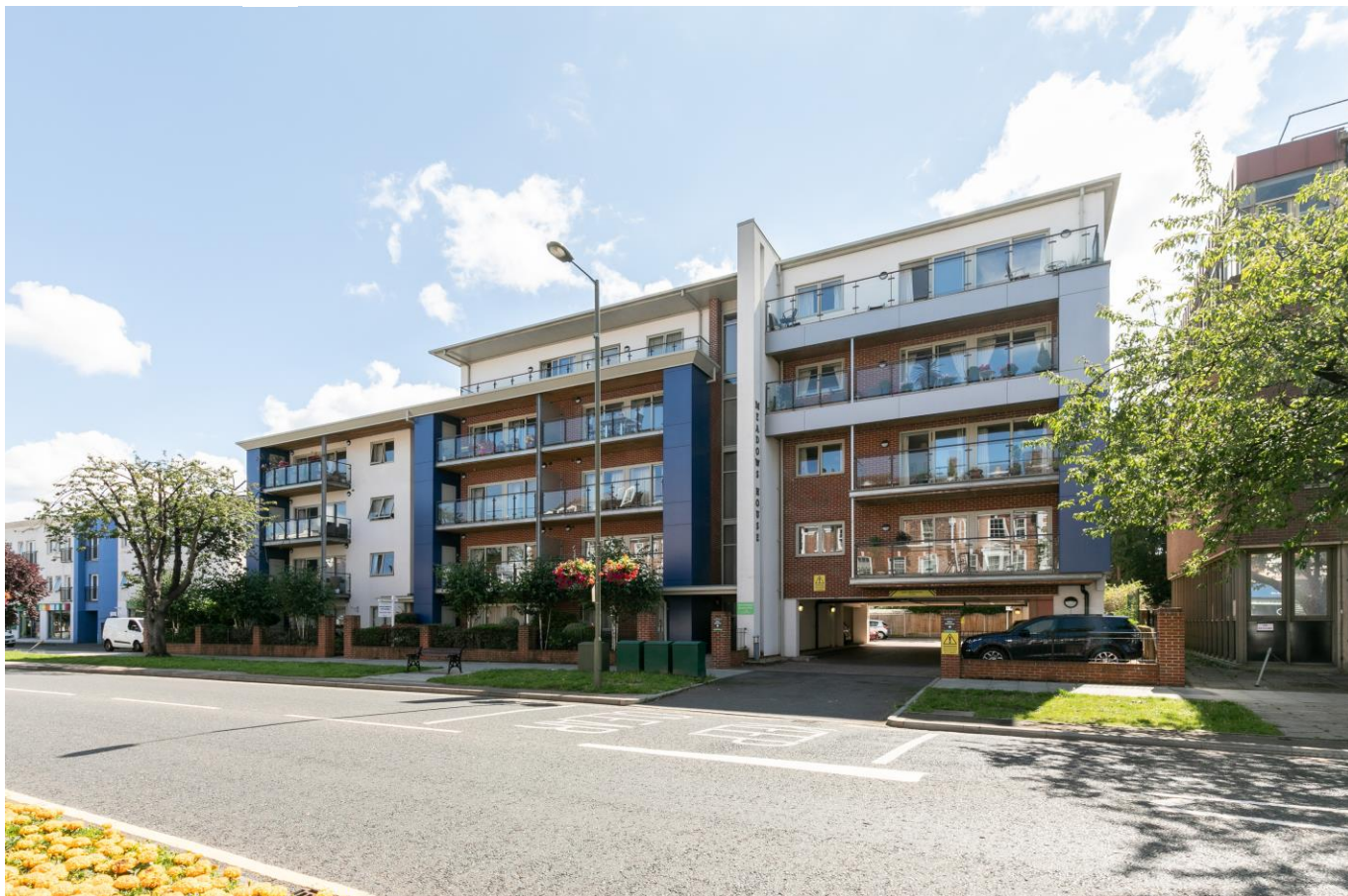
15 Meadows House New Zealand Avenue Walton-On-Thames Surrey KT12 1PG