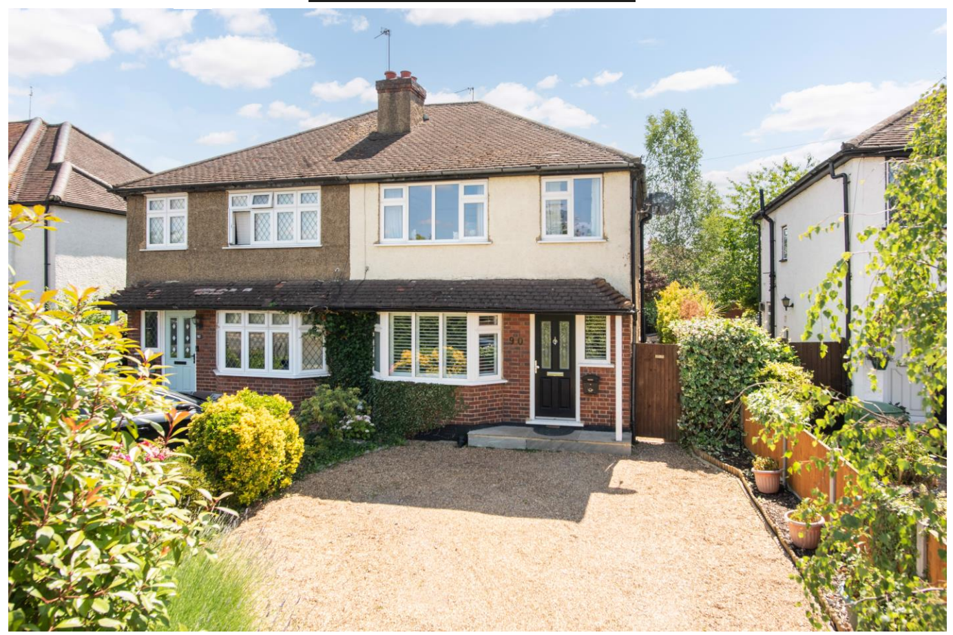
90 Rydens Road Walton-On-Thames Surrey KT12 3DS Offers Over £600,000