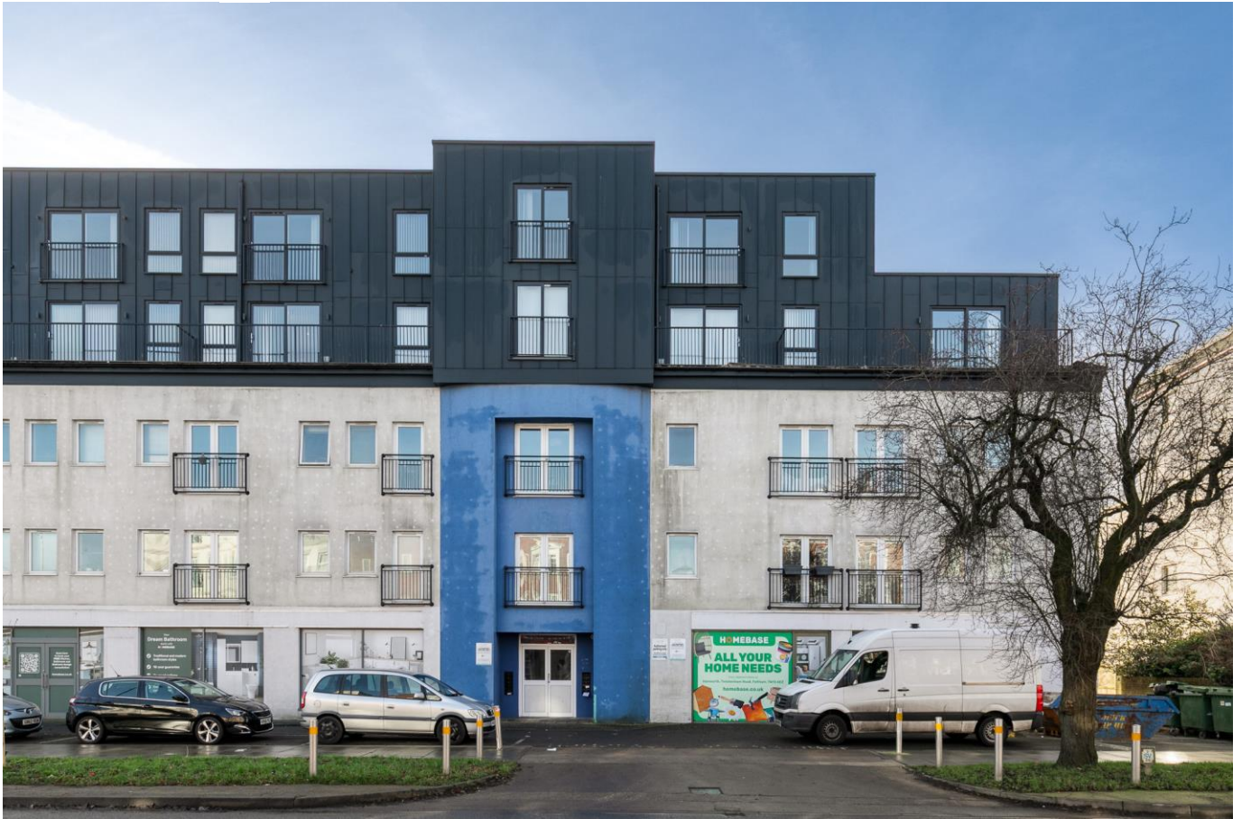
25 Auckland House New Zealand Avenue Walton-On-Thames Surrey KT12 1PL