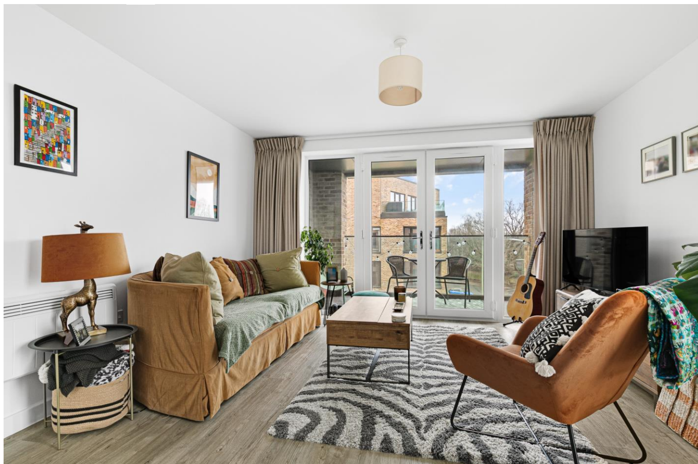
23 Somers House Spitfire Chase Walton-On-Thames Surrey KT12 1FW