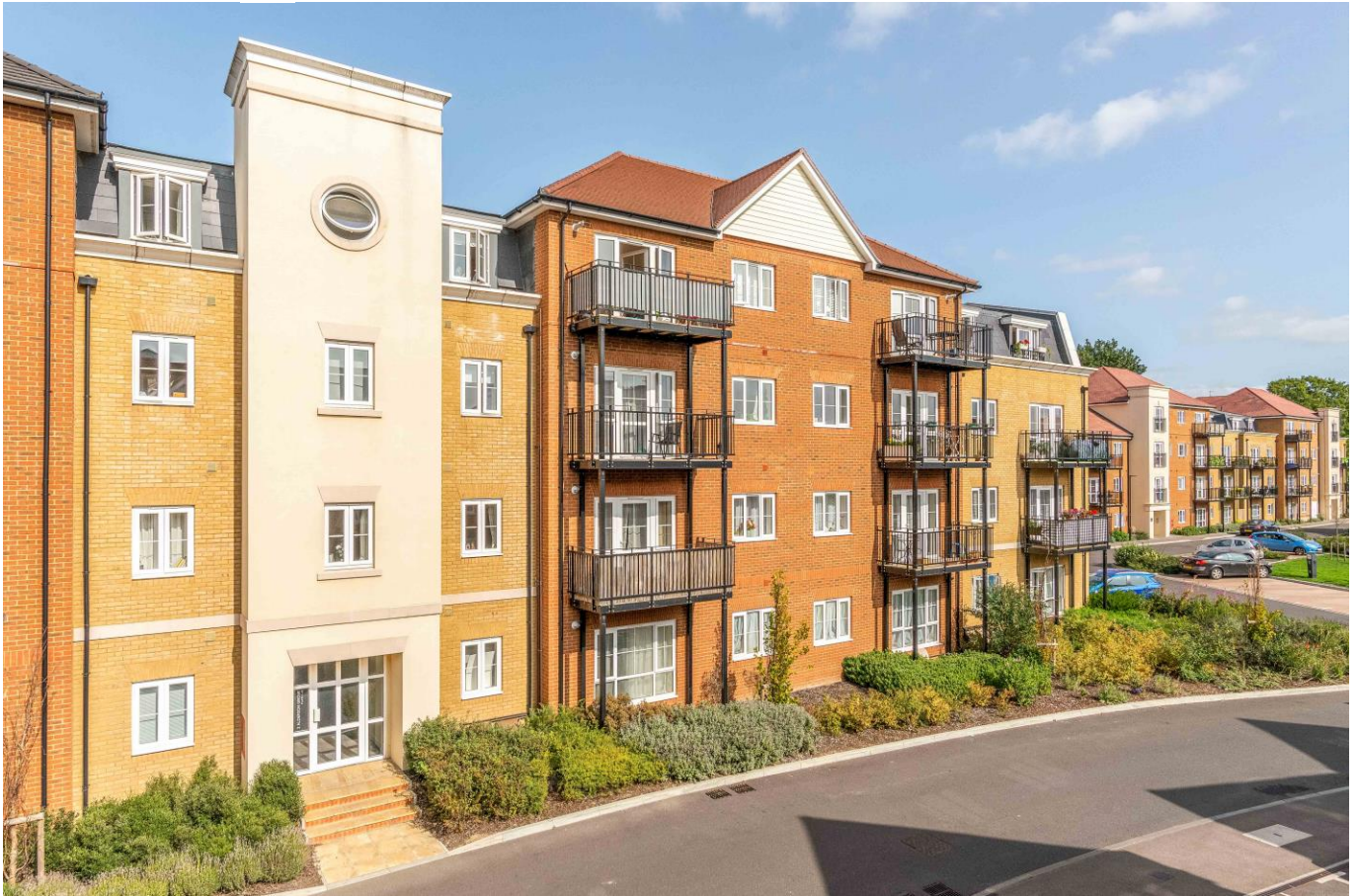
Flat 14, 2 Alderson Grove Hersham Walton-On-Thames Surrey KT12 5EG