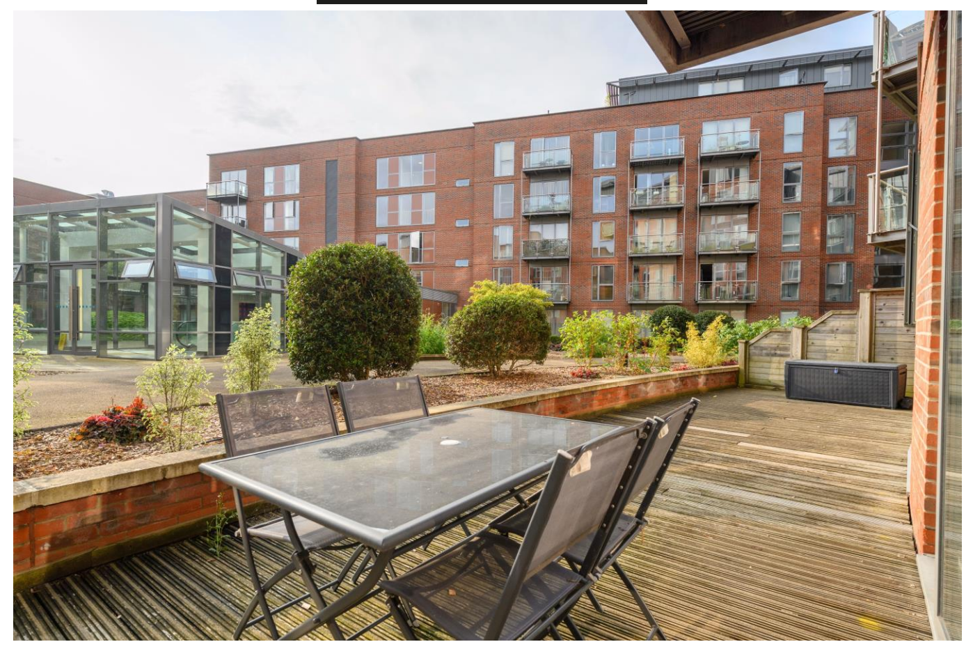
121 The Heart Walton-On-Thames Surrey KT12 1GB Guide Price £400,000