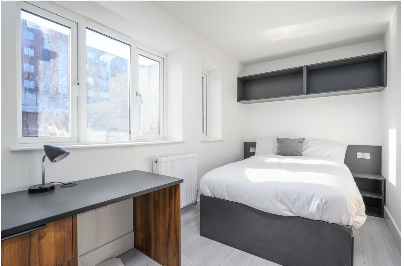
Room 1, Apartment 1 34a High Street Walton-On-Thames Surrey KT12 1BZ