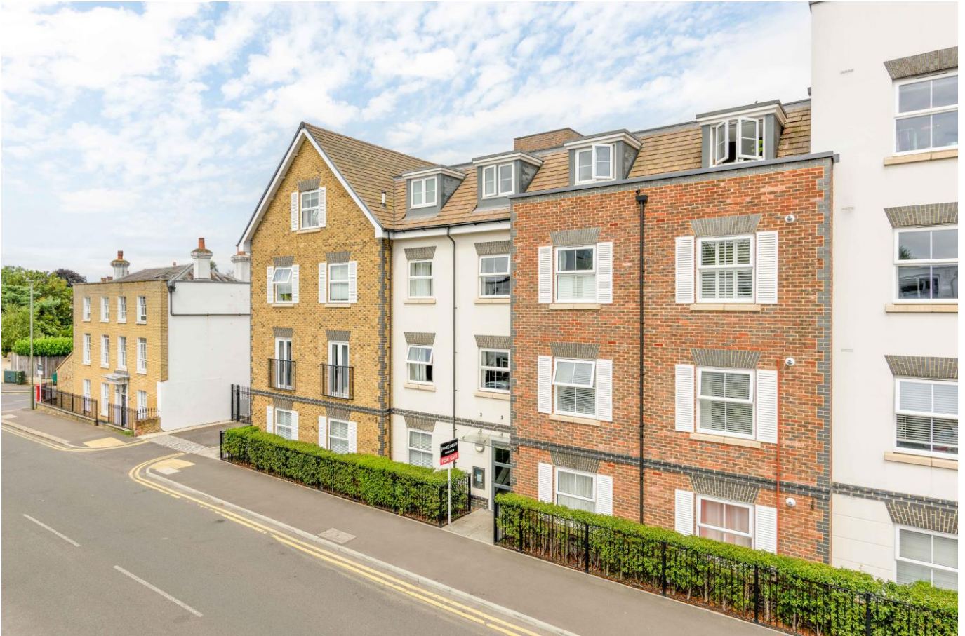
3 Bridge House Bridge Street Walton-On-Thames Surrey KT12 1AL