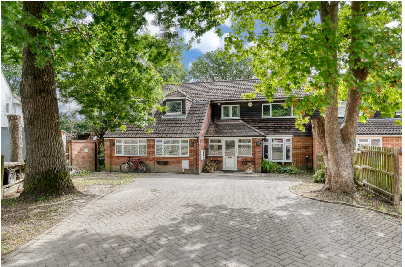
7 Chaucer Way Row Town Addlestone Surrey KT15 1LG