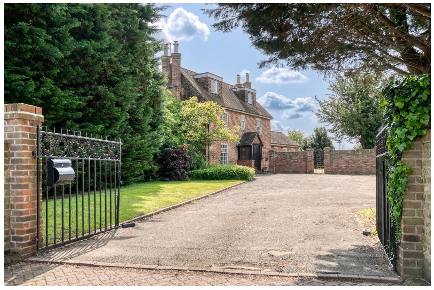
Orchard House Field Common Lane Walton-On-Thames Surrey KT12 3QD £3500pcm + Initial Deposit