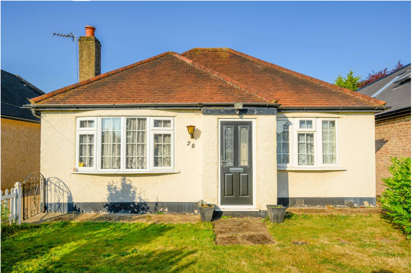
28 The Grove Walton-On-Thames Surrey KT12 2HP