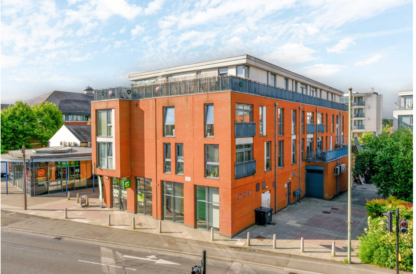
19 Liberty House Guildford Street Chertsey Surrey KT16 9GU