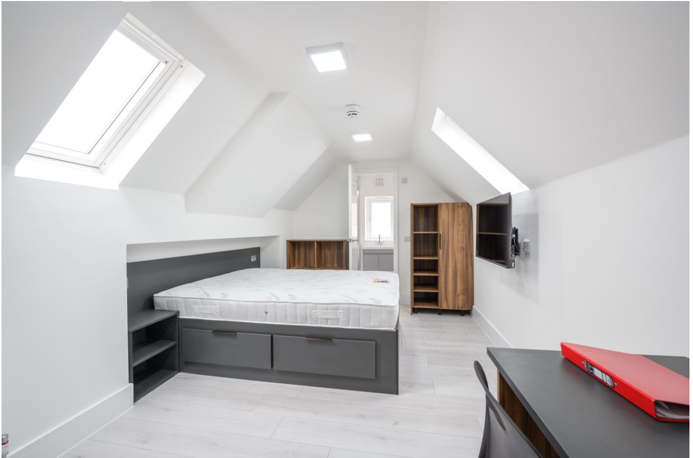
Room 5, Apartment 2 34a High Street Walton-On-Thames Surrey KT12 1BZ