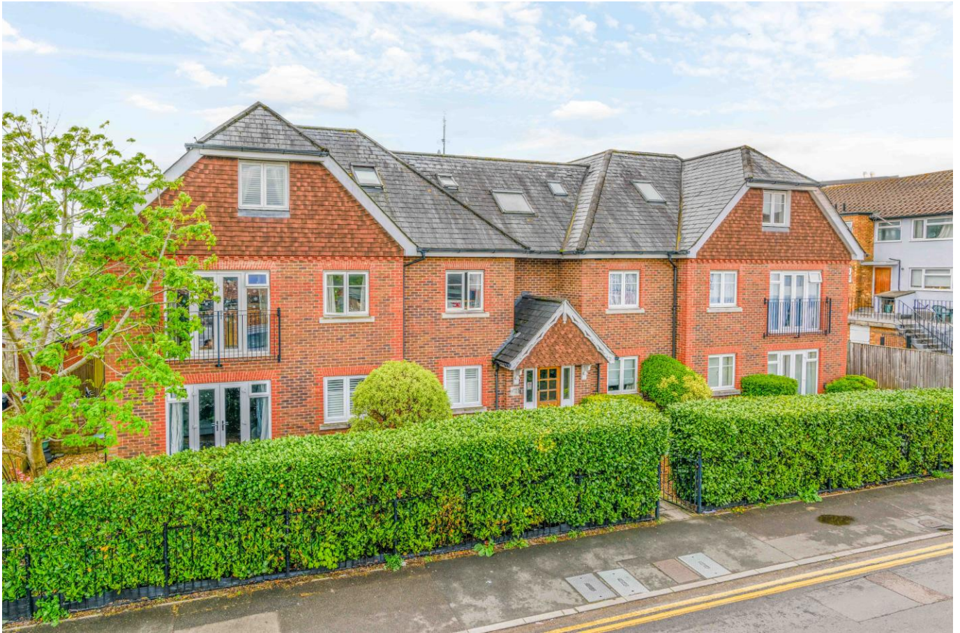
3 Weylands Court Corrie Road Addlestone Surrey KT15 2HT